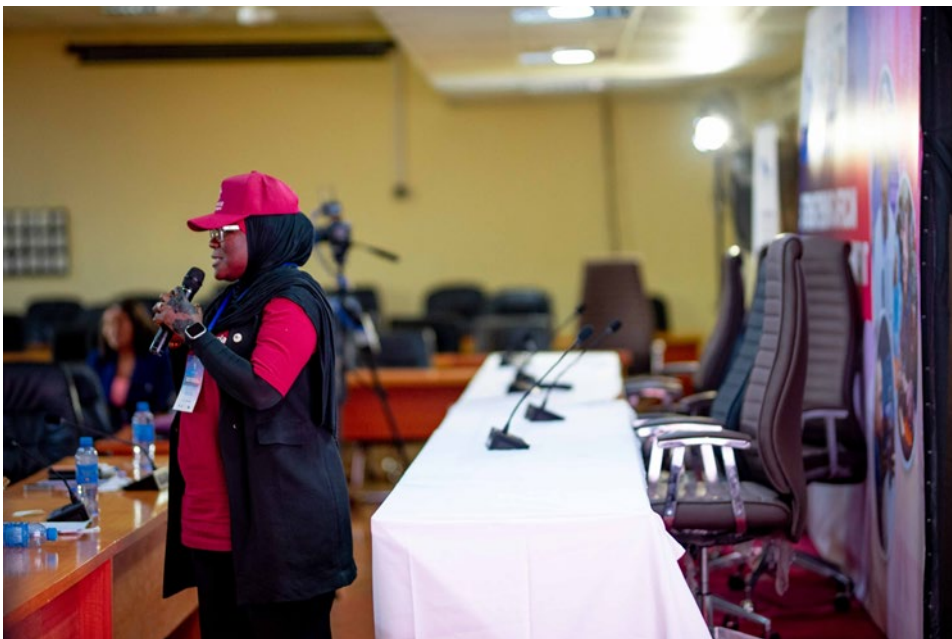
Figure 4: ECRs taking on leadership and advocacy roles.