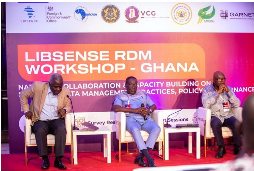
Figure 6: LIBSENSE RDM workshop in Accra, Ghana, January 2024

Through these experiences, LIBSENSE has not only enhanced the ECRs' confidence and skills but also enabled them to become more effective advocates for open science. This empowerment has led to more informed, capable, and confident researchers and librarians who can make significant contributions to their environments.