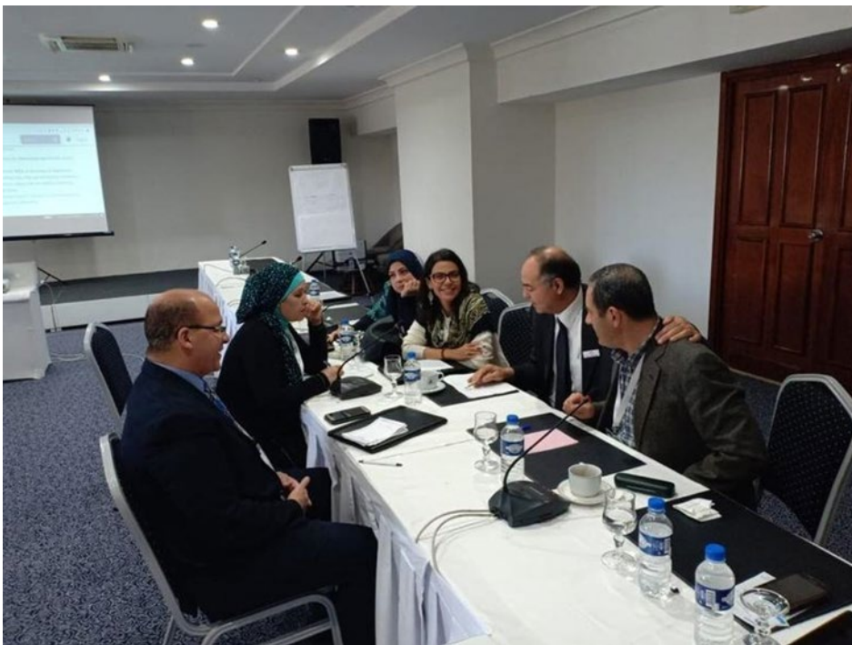
Figure 1: ASREN representatives in conversation with librarians in Tunis LIBSENSE workshop in 2019.