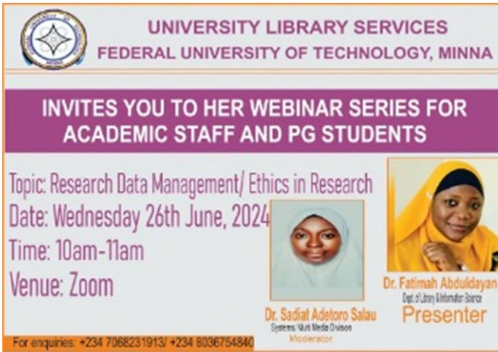
Figure 3: RDM activities initiated by ECR networks spawned by LIBSENSE.