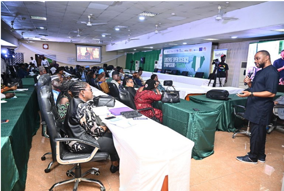
Figure 2: LIBSENSE Open Science Symposium Nigeria in 2023

By fostering an interdisciplinary and collaborative approach, LIBSENSE has strengthened the capacity of librarians and NRENs to work together and to contribute to the broader goals of Open Science in Africa.