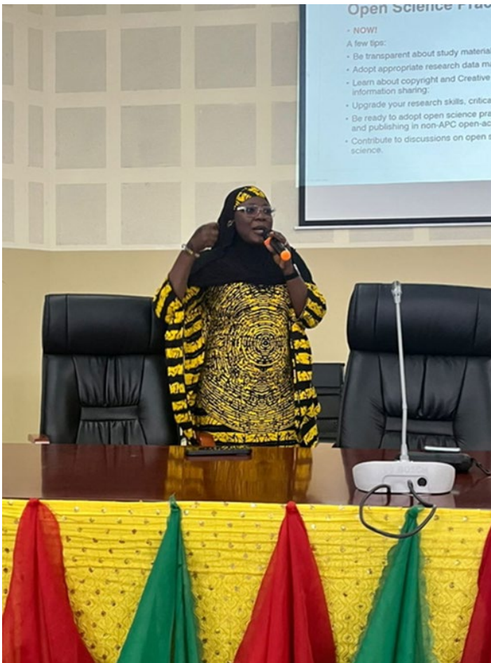
Figure 7: One of the LIBSENSE postdoc researchers giving a presentation at the Nigeria Library Authority Association Conference 2024