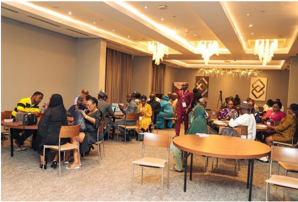
Figure 5: LIBSENSE RDM workshop in Lagos, Nigeria, January 2024